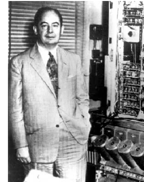
Jon von Neumann (1945)